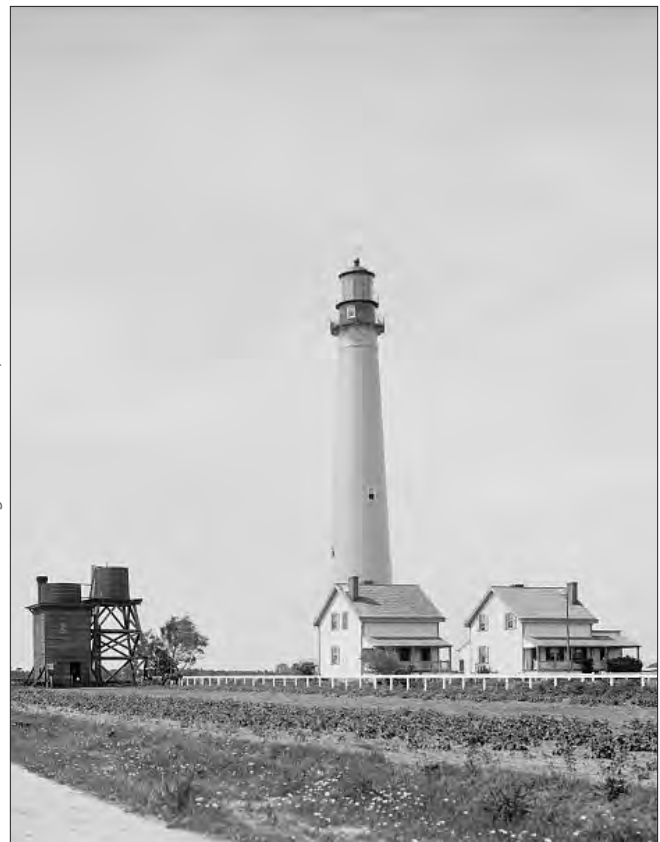
LC-DIG-det-4a19499. Detroit Publishing Co. no. 039194, c. 1900.

When completing a significant intervention or construction project, it is also prudent to ensure contractors minimize risk associated with the work including limiting or restricting welding operations, limiting or prohibiting flammable or toxic materials, providing adequate security, and requiring the prompt removal of construction debris and rubbish.