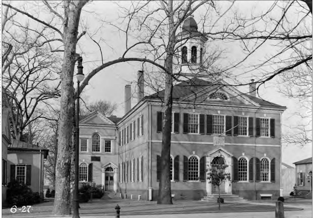
A detailed assessment of the Burlington County Courthouse resulted in its restoration and continued reuse.