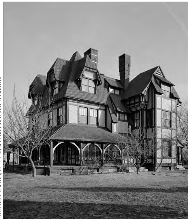
HABS NJ.5-CAPMA,68--1. Jack E. Boucher, date unknown.

Since they are typically prepared in anticipation of a specific project, the long-term benefit of a PP as a resource document is considerably less than a HSR. However, PPs can be supplemented and updated to reflect the depth of information found in a HSR.