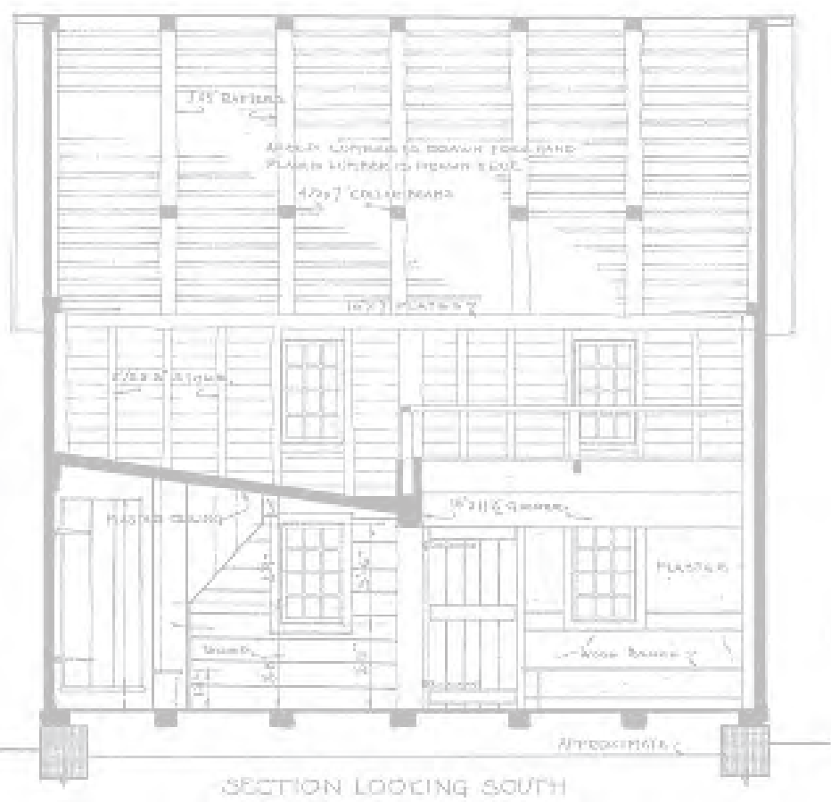
Measured drawings, such as these building sections of the Friends Meetinghouse of Randolph, can be a helpful tool to clarify existing conditions and note areas of deterioration. HABS NJ-145. Henry W. Vreeland, Delineator, 1935.