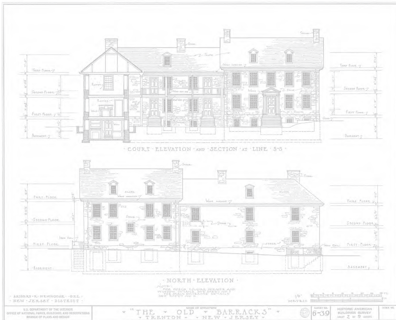
Measured drawings, such as this plan of the Old Barracks, can be a helpful tool to clarify existing conditions and note areas of deterioration. HABS NJ,11-TRE,4- (sheet 2 of 9) - Old Barracks, South Willow Street, Trenton, Mercer County, NJ.