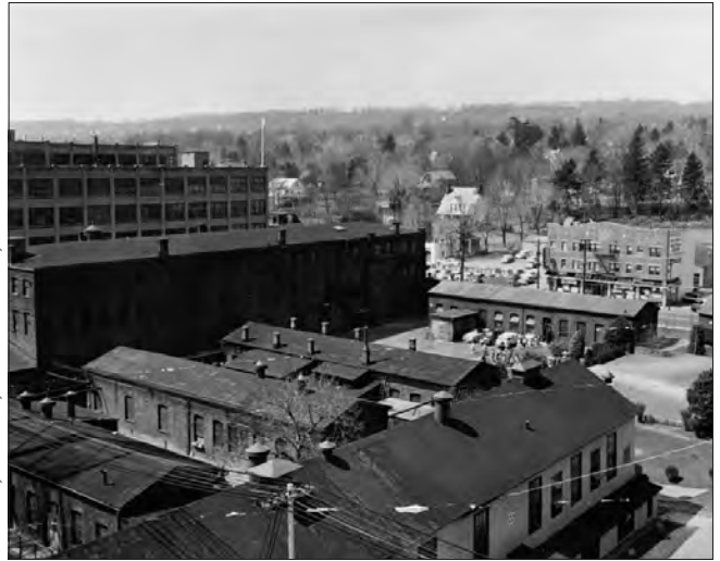
Sites with multiple buildings, such as the Thomas A. Edison Laboratories, Essex County, NJ, will be more expensive to document than sites with one building.