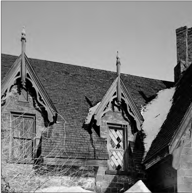
HABS NJ,2-HOHO,1-. Jack E. Boucher, 1971.

Regular maintenance, such as replacing broken glass as seen in the photograph from the Hermitage (Ho-Ho-Kus), can reduce vulnerabilities and hazards at a property.