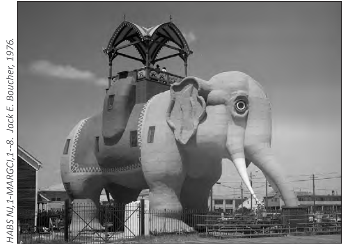
Lucy the Elephant is one of the more unusual buildings in New Jersey. Preservation of Lucy the Elephant required addressing moisture-induced deterioration of the wood sheathing that holds the metal skin in place.

When owners and stewards commission a planning document, they should understand the meaning of the various treatment options and the potential use of the document to outline future work at a site, the likely outcome of fund raising efforts or funding agency requirements. Potential funding agencies and the New Jersey Historic Preservation Office (HPO), if involved, will review the final document and its recommendations for conformance and consistency with the appropriate treatments as defined by the Standards . Recommendations of specific treatments in Historic Structure Reports, Preservation Plans and amendments should be in conformance with the overall Standards or they may not be eligible for state or federal funding or reimbursement by other funding agencies. If work is completed based upon the nonconforming recommendations, it may result in the loss of important building materials or fabric or an inconsistent interpretive history.