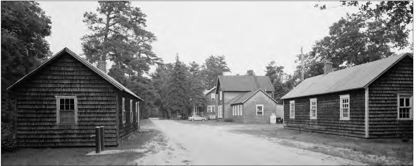
The Whitesbog Village and Cranberry Bog site includes multiple buildings within the context of a historic landscape.